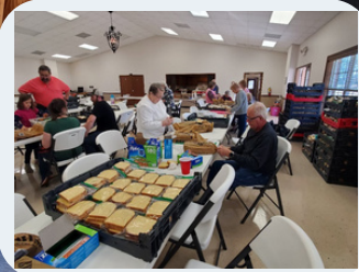
Buck Creek UMC held a Barbecue on Feb. 15. They sold over 2000 plates and donated/delivered an additional 1500 plates to the county Soup Kitchen