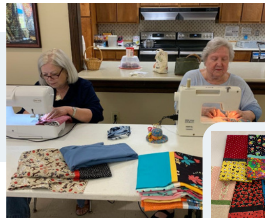
A group of local women from Brooklet United Methodist Church are in the business of pillowcase making. These pillowcases provide sweet dreams for special children in and around our community.