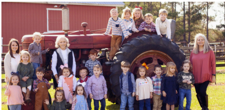
Twin City UMC preschool program has 21 children this year!