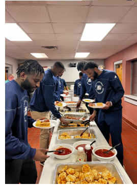
Pittman Park UMC hosted the GSU Men and Women Basketball teams for a low country boil