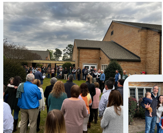
Pittman Park students traveled to North Carolina for a Youth Retreat.