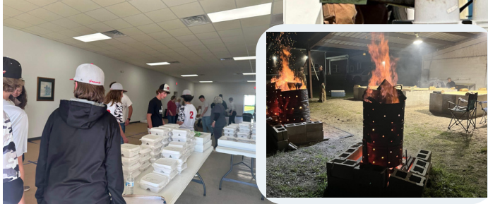
Sylvania UMC held their annual United Methodist Men's Club Barbecue. Funds will go toward providing food boxes during Christmas time to feed the community.